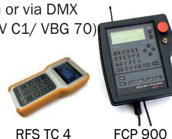
RFS TC 4